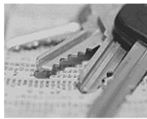
Controllable Insurance Cover...