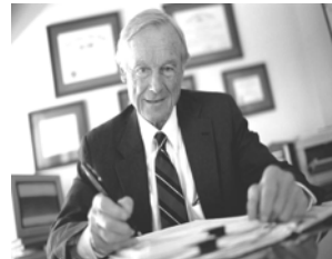
Claims & ULR...