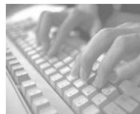
Motor Insurance Database...

Authorised and regulated by the Financial Services Authority Firm reference number 307454