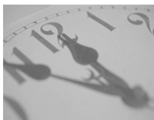
Self Drive Daily Rates...