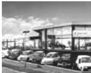
Motor Traders Premises...